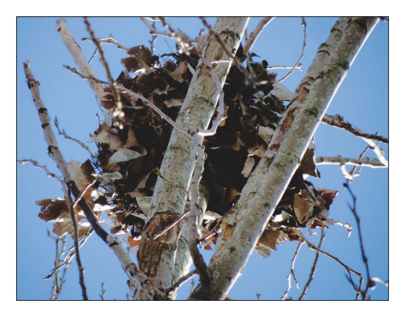
Figure 2. Nest of Callosciurus erythraeus covered by leaves. (Photo: Borja Baguette Pereiro).

include the flea Polygenis ( Polygenis ) rimatus , the mites Androlaelaps fahrenholzi and Orni-thonyssus cf. bacoti , and the botfly Cuterebra sp. Mites of the genus Cheyletus that are not considered parasites were also found (Gozzi et al. , 2013a). Endoparasites were represented by nematodes of the genus Stylestrongylus and Pterygodermatites (Gozzi et al. , 2014). Regarding zoonotic diseases, C. erythraeus was found to be a renal carrier of Leptospira interrogans (samples obtained in Cañada de Gómez, Santa Fe province) and could be involved in the epidemiology of leptospirosis (Gozzi et al. , 2013b). In addition, feces and serum of squirrels from the main invasion foci were studied for detection of Salmonella spp. and Toxoplasma gondii respectively, finding negative results (Gozzi, 2015).