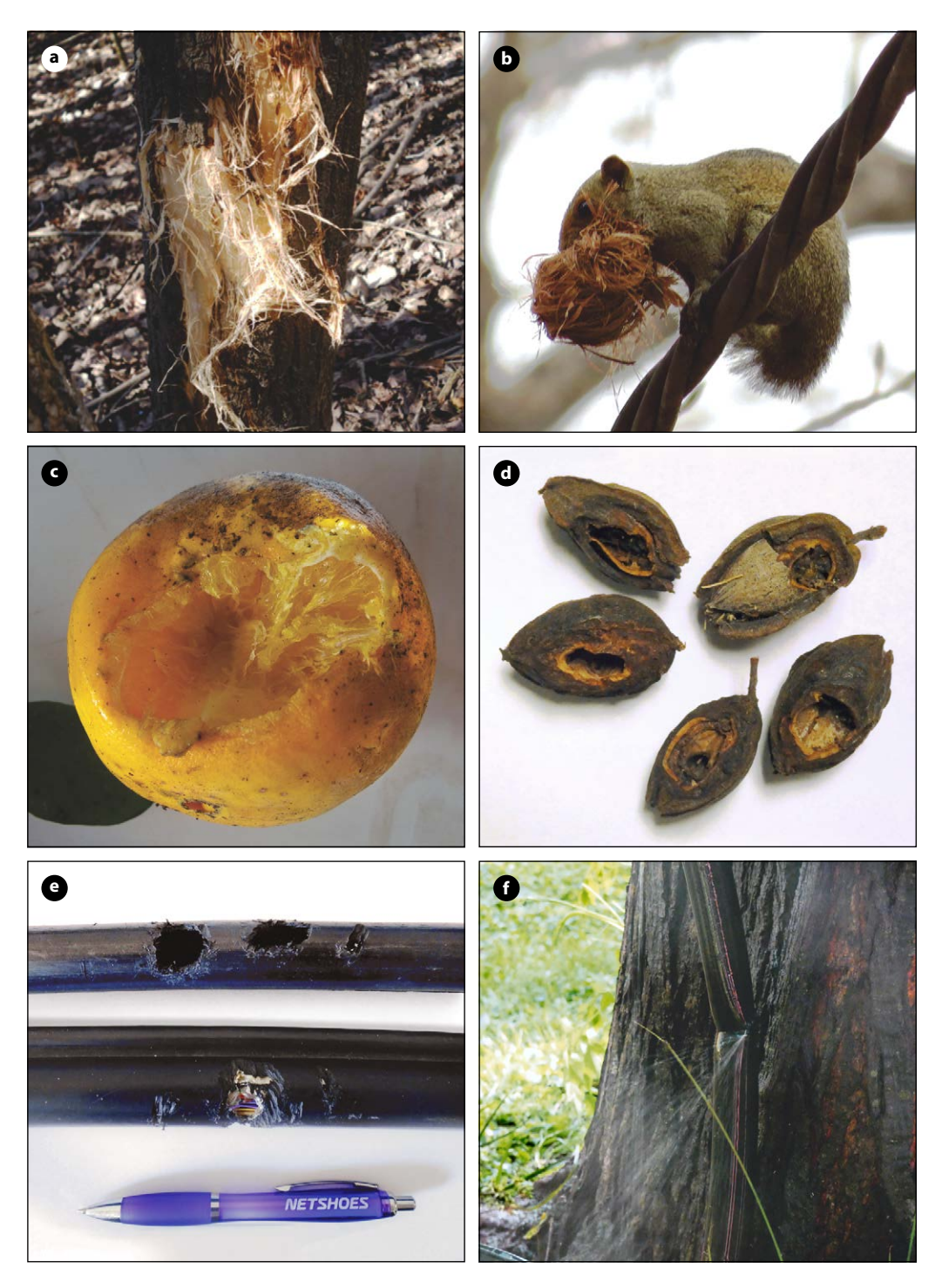
Figure 4. a. Damage caused by Callosciurus erythraeus on a tree by debarking; b. a squirrel with a ball of bark in its mouth; c-d. fruits (orange and nuts) damaged by squirrels; e-f. gnawed cables and irrigation hoses.