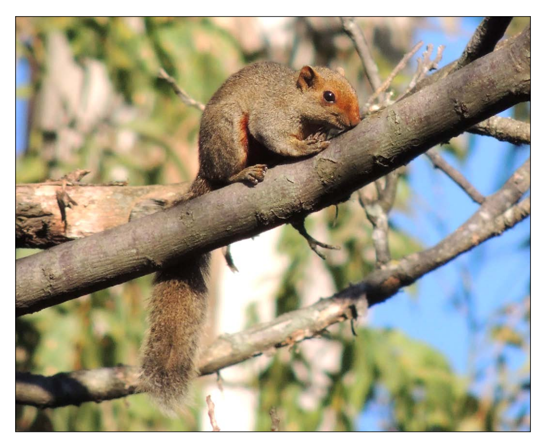
Figure 1. Adult of Callosciurus erythraeus in Buenos Aires province, Argentina. (Photo: Marina Hertzriken).

Callosciurus erythraeus is a medium-sized diurnal tree squirrel (Fig. 1). It is native to southeast Asia, and it has been introduced in Argentina, as well as in France, Belgium, Japan, Hong Kong, Italy and the Netherlands (Lurz et al. , 2013). It inhabits different types of both continuous and fragmented arboreal habitats in natural and human-made forested patches. In Argentina, it occurs mainly in rural, urban, suburban and residential areas, including within or near protected areas, urban parks and commercial plantations for wood and fruit production (Guichón and Doncaster, 2008; Benitez et al. , 2013; Hertzriken, 2021).