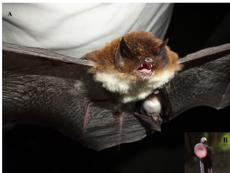
Fig. 1. Adult female and juvenile male of Thyroptera tricolor from Barrancabermeja, Santander, part of the new records for the Middle Magdalena Valley (A). Detail of the wing circular disk of the adult female (B).

All known records of T. tricolor for Colombia were obtained by comprehensive revision of the literature published on the species, data bases of the Global Biodiversity Information Facility (GBIF), Mammal Networked Information System (MaNIS), Sistema de Información sobre Biodiversidad de Colombia (SIB) (data sets including records from the American Museum of Natural History, AMNH; Field Museum of Natural History, FMNH; United States National Museum, USNM; Instituto Alexander von Humboldt, IAvH) and the information directly