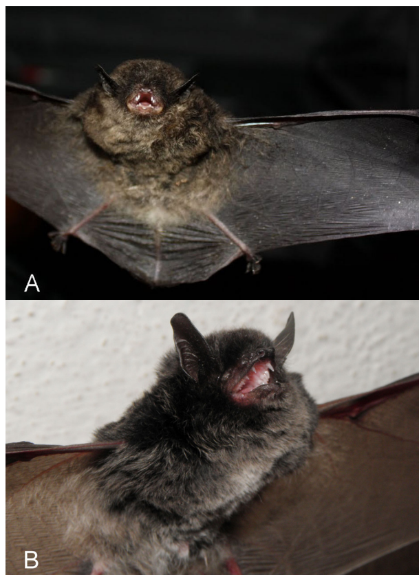
Fig. 2. Individuals of Myotis izecksohni from Minas Gerais State, Southeastern Brazil. A. Adult male from Santa Rita do Jacutinga (ALP 9665). B. Subadult female from Aiuruoca (LDM 5578).

Our specimens conform closely with the combination of characters that distinguishes M. izecksohni from all other Myotis species. The specimens have plagiopatagium attached to the level of the toes by a broad band of membrane, conspicuously long and silky fur, dorsal fur slightly bicolor with dark bases and dark brown tips, ventral fur bicolor with well-defined banding, dark brown bases and pale grey tips, trailing edge of the interfemoral membrane dark colored and lacking fringe of hairs (only few sparse and short hairs are present), membranes dark brown, braincase long, narrow and flattened, postorbital constriction narrow, breadth across the canines/postorbital breadth ratio greater than 1.00, supraoccipital region rounded and sagittal crest absent. The second upper premolar (P3) is smaller than the